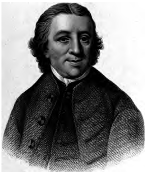
PETER BÖHMER, BISHOP OF THE CHURCH OF THE UNITED BRETHREN